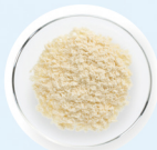
純素膠原蛋白 Vegan Collagen