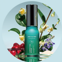
超效修復精華 Correcting Serum

+45% 效果提高：幫助肌膚抵禦導致衰老跡象的外界壓力 better to help reduce external stressors that can contribute to signs of aging