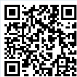
產品詳情 Product Information