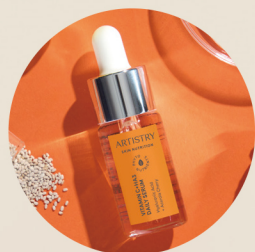
三重玻尿酸維C精華液 Vitamin C+HA3 Daily Serum