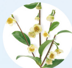
康普茶發酵物 Kombucha Ferment