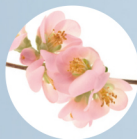
日本梅子 Japanese Plum