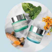
再生系列或 緊緻系列 面霜* Renewing or Firming Moisturizer

+73% 效果提高：幫助肌膚抵禦導致衰老跡象的外界壓力 better to help reduce the effect of stressors that contribute to signs of aging