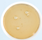
發酵寡肽 Fermented Oligopeptide