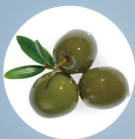
橄欖萃取物 Olive Extract