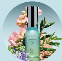
超效防護精華 Defying Serum

+55% 效果提高：幫助肌膚抵禦導致初老跡象的外界壓力 better to help protect the skin from external stressors that contribute to early signs of aging