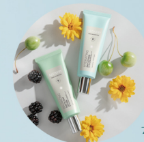
平衡系列 或 保濕系列 保濕霜* Balancing or Hydrating Moisturizer

+378% 增強肌膚自然防禦力，幫助延緩明顯老化跡象 better to boost skin's natural defense system to help delay visible signs of aging