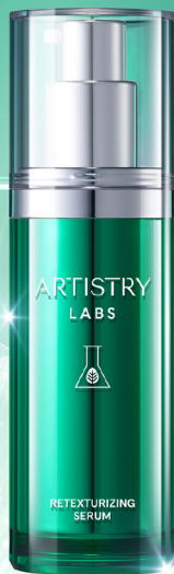
逆時重塑煥膚精華 Retexturizing Serum