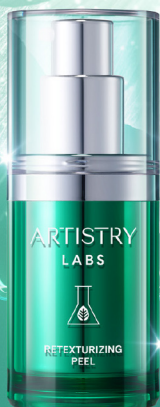
逆時重塑煥膚啫喱 Retexturizing Peel